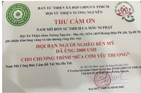
Fig. 4: Acknowledgement from Tuong Nguyen pagoda: 2000usd on 30 Aug. and another 2000usd on 26 Sep.