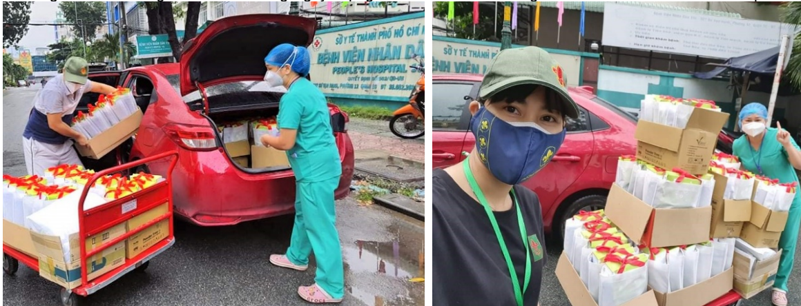
Fig. 5. Gifts to workers at 115 Hospital. HQCBM society.