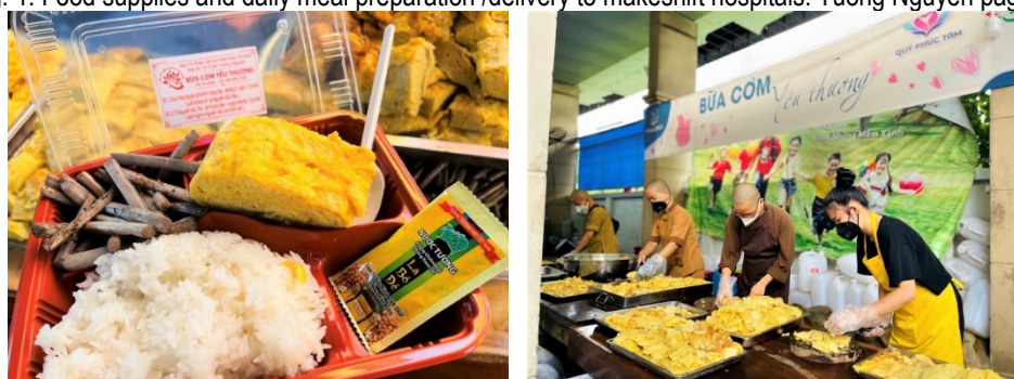
Fig. 3. The nuns and volunteers are preparing vegetarian and non-vegetarian meals. Tuong Nguyen pagoda.