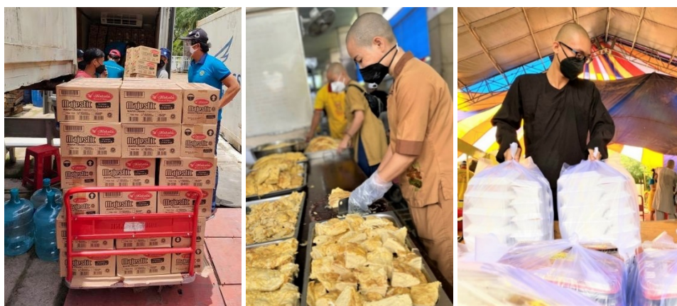
Fig. 1. Food supplies and daily meal preparation /delivery to makeshift hospitals. Tuong Nguyen pagoda.