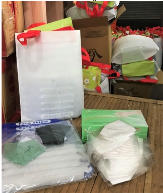
Fig. 4. Gloves, N95 disposable masks, reusable masks, and face shields to hospital laborers. HQCBM society.